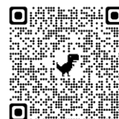
HiMama QR code

https://www.facebook.com/TLCEarlyLearning