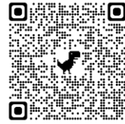
Lillio QR code

Facebook https://www.facebook.com/TLCEarlyLearning